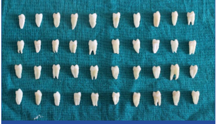
[Table/Fig-1]: Forty premolars specimen.

This in vitro study was carried out in the Department of Conservative dentistry and Endodontics of Dayananda Sagar College of Dental Sciences, Bengaluru, Karnataka, India. Forty intact human maxillary first premolars indicated for extraction for orthodontic or periodontal reason were selected for the study and stored in saline [Table/Fig-1]. Carious, restored, hypoplastic and fractured teeth were avoided. The teeth were mounted with adjacent teeth in an artificial dental jaw model. Standardised conventional mesio-occlusal preparations were made on these teeth using No. 245 bur with an airotor hand piece. The dimensions of these preparations were 2 mm buccolingually and the gingival seat placed at the level of CEJ and 1.5 mm deep axially, verified using a periodontal probe. No. 245 bur was changed after every five preparations. Tofflemire matrix band retainer was adapted to the preparation to prevent gingival overhang of the restoration.