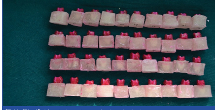
[Table/Fig-2]: Mounted specimens after insertion in dye.

After the restorations were completed, excess proximal flash was removed with a sharp hand scaler. The apical foramen was sealed by embedding the teeth in acrylic resin blocks and two coats of nail varnish applied to the entire tooth, except for the restoration and 1 mm around it [Table/Fig-2]. The specimens were then subjected to thermocycling at temperatures of 5\pm1^{\circ} C and 55\pm1^{\circ} C for 1000 cycles with 30 seconds dwell time to simulate oral conditions.